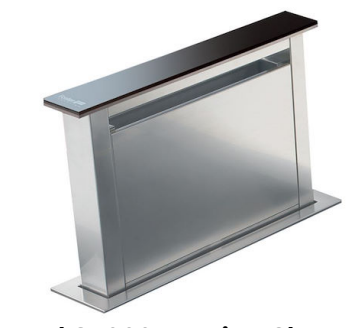
Hood S4000 Domino Ghost 2451 000