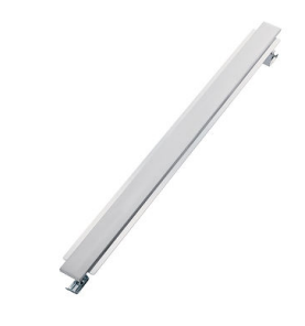
Spacer for Domino elements 8320 000